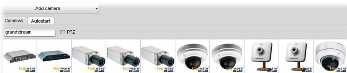
Fig.3: Adding the Grandstream IP Camera or Video Encoder using go1984 search filter