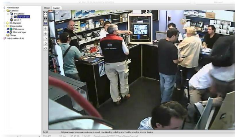
Fig.5: Video Streaming of a Grandstream IP Camera or a Video Encoder

4. Grandstream IP camera or Video Encoder video streaming will be displayed on go1984 under the image tab (see Fig. 5)