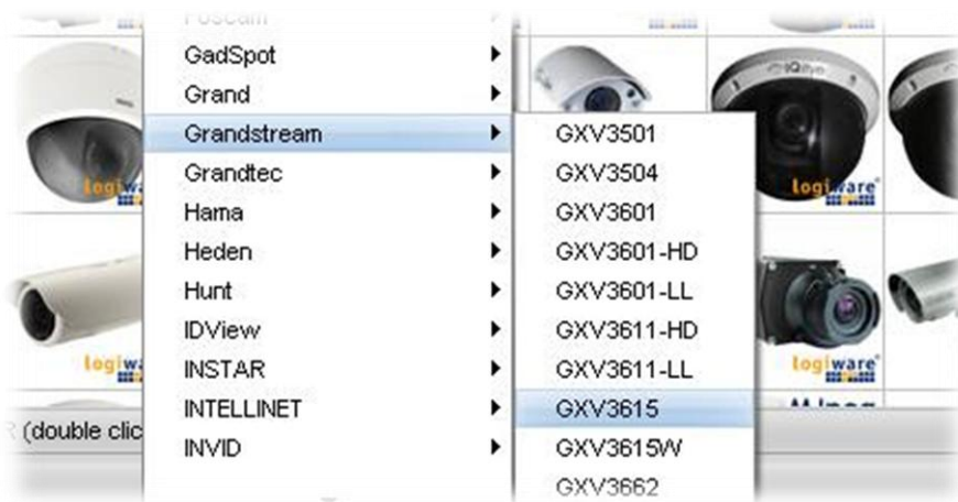
Fig.2: Adding the Grandstream IP Camera or Video Encoder using the pull down menu